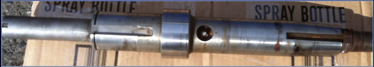
(Above) A marine input pump shaft with a worn bearing fit over the keyway

Thermal Coating is a fast economical and proven repair for common issues such as bearing surface wear and seal wear on a shaft.