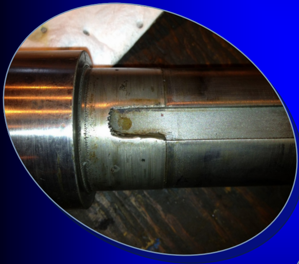
(Left) Before Repair : A close up of the area to be rebuilt. Bearing sits partially over the key way area.